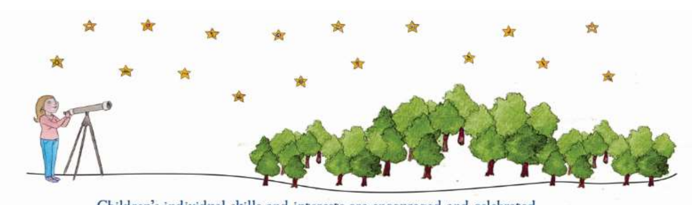
Children's individual skills and interests are encouraged and celebrated

Prospective parents are welcome to visit the school by appointment through the School Office.